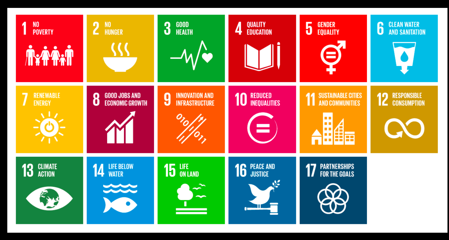
Solutions-Summit @UN - SDGS >800 entries of solutions-in-progress from >100 countries in 2 weeks