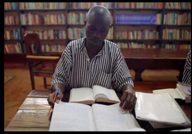
Africa Prisons Project – from Uganda