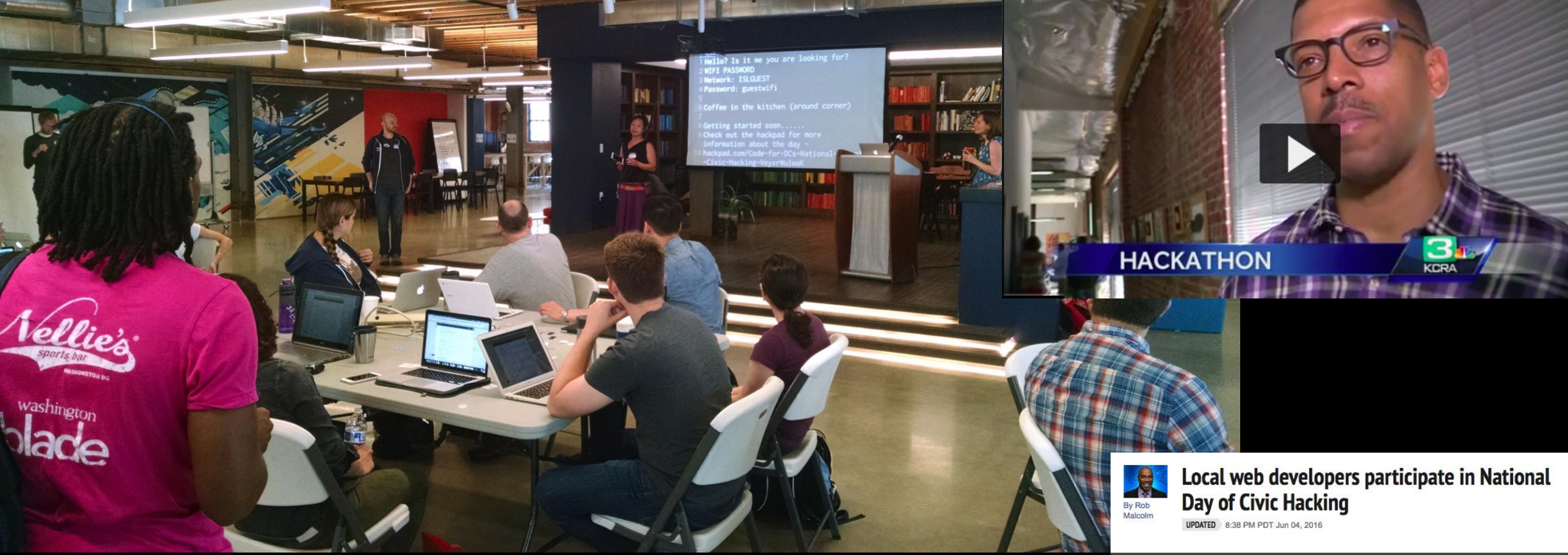
Between June 3-5, 2016 #hackforchange in: